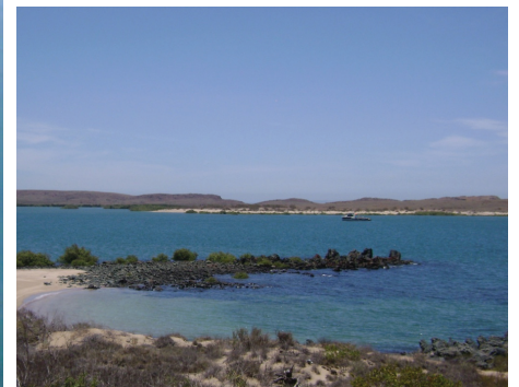
Dixon Island from Anketell