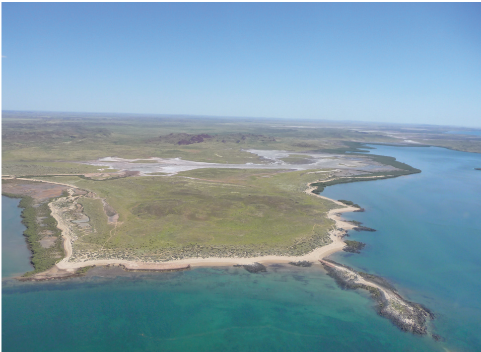
Anketell aerial view